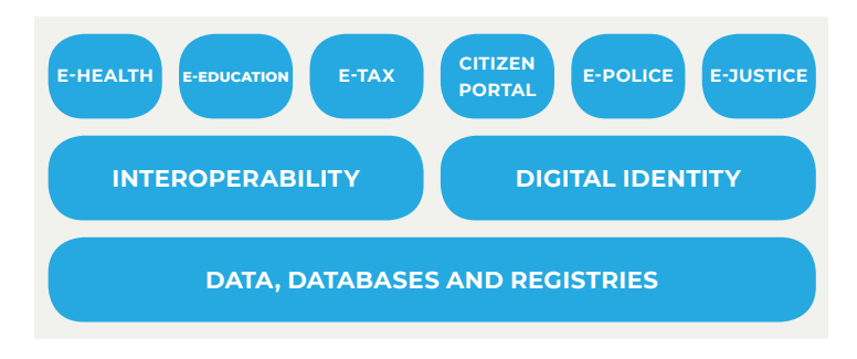
Figure 2 A conceptual architecture, key functional enablers of e-governance